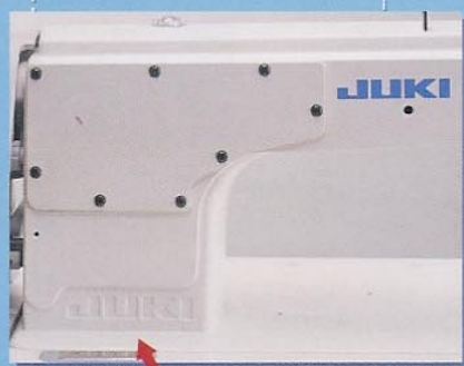
Embossed JUKI mark

By providing a presser foot with a higher lift(13mm), a light-touch stitch dial, a throat plate with marker grooves that can be used as guide for seam allowance, and other easy-to-operate functions, the burden on the operator is lightened, and productivity is further increased.