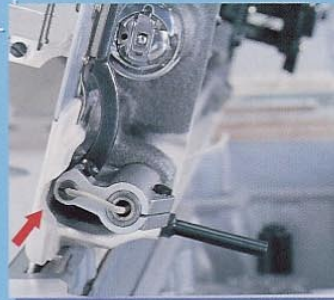
Feed eccentric pin

In addition, the machine is provided with a mounting seat for attachment to improve workability while replacing the attachment and increasing the durability of the machine bed surface.